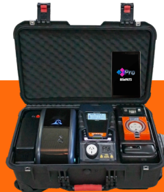
The TnP 3PLM 50A Single & 3 Phase Portable Appliance Test & Print Kit WCM-TnP-3PLM-50A