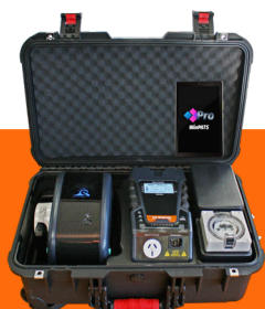
The TnP 3PLM 20A Single & 3 Phase Portable Appliance Test & Print Kit WCM-TnP-3PLM-20A